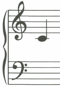
© 1969, 1984 General Words and Music Company 25 Middle C