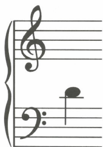
© 1969, 1984 General Words and Music Company 19 D