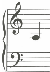
© 1969, 1984 General Words and Music Company 23 A