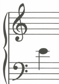
© 1969, 1984 General Words and Music Company 20 E